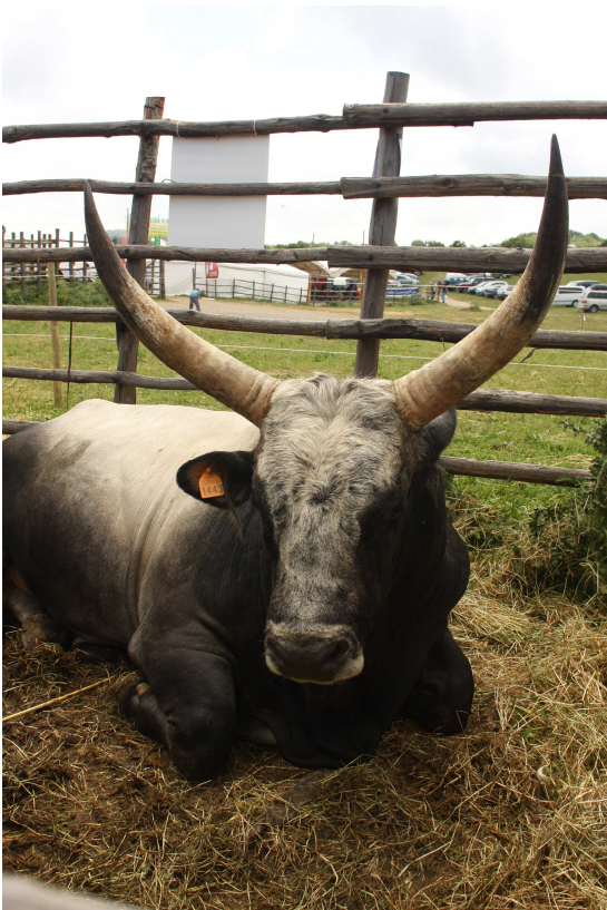
Magnus, senior champion bull – Owner Tenuta Nuovo Poggione

This final featured the participation of the catalogue's no. 2 owned by the Agricultural University of Monteromano, ranking 1 st in the 2 nd category, as well as animals no. 5 and 7 ranking 1 st , respectively, in the 3 rd and 4 th category, both belonging to the Musignano farm of