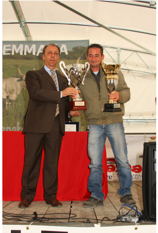
The Farm "Tenuta di Castelporziano" awarded as the best exhibitor of the show and for its reserve

edition of the National Show arrived from the high number of cows with their calves at heel, an aspect that contributed to enhancing the striking maternal attitude of the Maremmana breed, seen in the correctness and volume of the udders. Therefore the productive aspects did not pass unnoticed, as seen by the assignment of the blue ribbon to the most productive dam of each of the categories 7, 8, and 9. The winners of access to the final for the "Lucio Migni" trophy, for the dam with the best career, were: