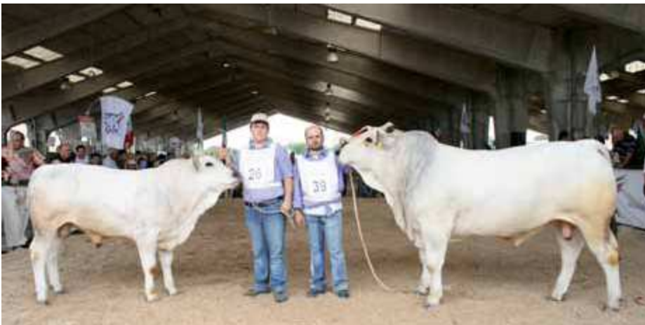
At the right Tulipano, the junior champion bull. At the left Tuffo, the reserve junior champion bull of the show.