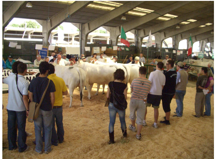
A moment of the judging competition for students of agricultural schools (ITAS)

The breed showed its best in the prestigious Villa Potenza ring. The 24th edition of the National Herdbook Show of the Marchigiana breed, held from 30 May through 2 June at the Villa Potenza cattle forum in Macerata, within the framework of the “RACI”, Rassegna Agricola del Centro Italia (Central Italy Agricultural Show), finally returned to its best levels, without the health restrictions that in the past had prevented the participation of the breeders of various provinces of the Marches and Abruzzo regions. In fact,