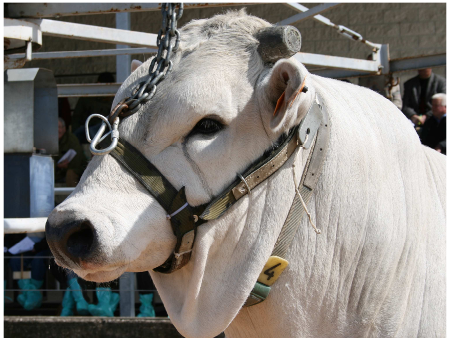
One of Chianina bulls on sale"

As usual, the bull calves were the stars of the ANABIC's three-day event and all three breeds cut a fine figure in the ring, showing not only significant test results but also a wide variety in terms of pedigree, with plenty of individuality. In keeping with tradition, the first day was set aside for the Marchigiana, which proposed a group of particularly uniform bulls, composed of four subjects that were eligible for AI and three that were approved for NS. All were sold during the auction. The first to enter the ring was