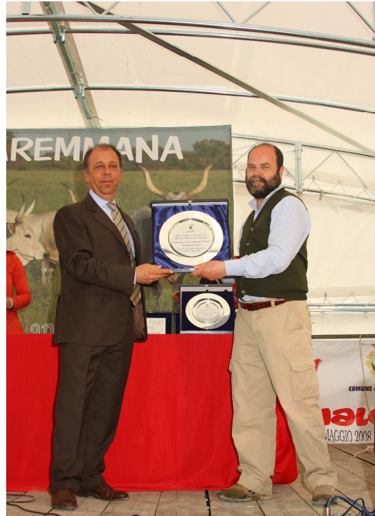
Cra – Pcm – Tor Mancina receive the trophy for the senior champion cow