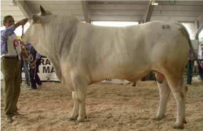
Socrate Valdolmo, reserve senior champion bull – Owner Az. Smargiassi p. e Le onori R.A.