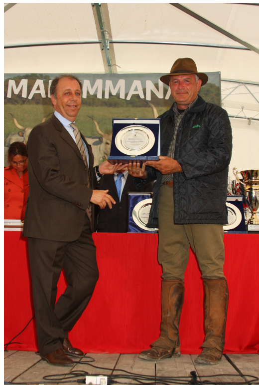
The farm of Alberese receive the trophy for the reserve junior champion heifer

Veterans also provided a heated competition, seen in the high number of yellow ribbons assigned by the judge in all classes. There were truly numerous stand-out cows for typicity, size, structural