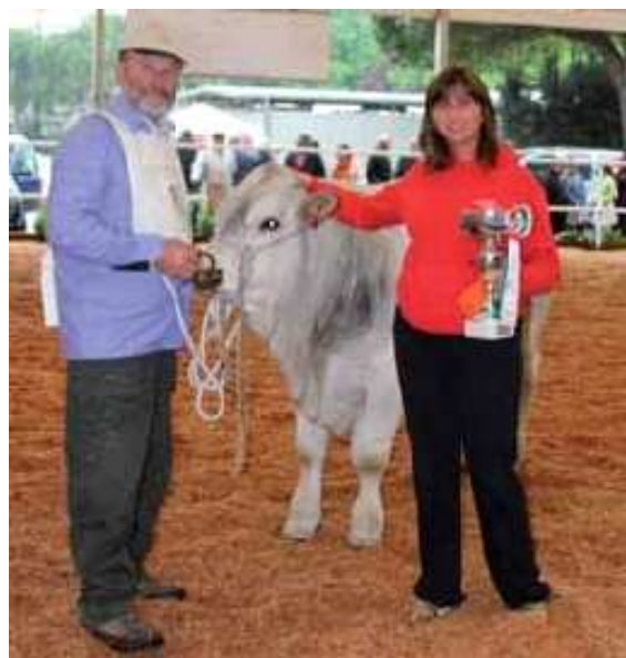
La Viola Ubaldo, Reserve, junior champion bull; Owner. La Viola; (RA)