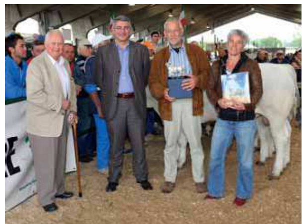
Awards of breeders delegation coming from Holland