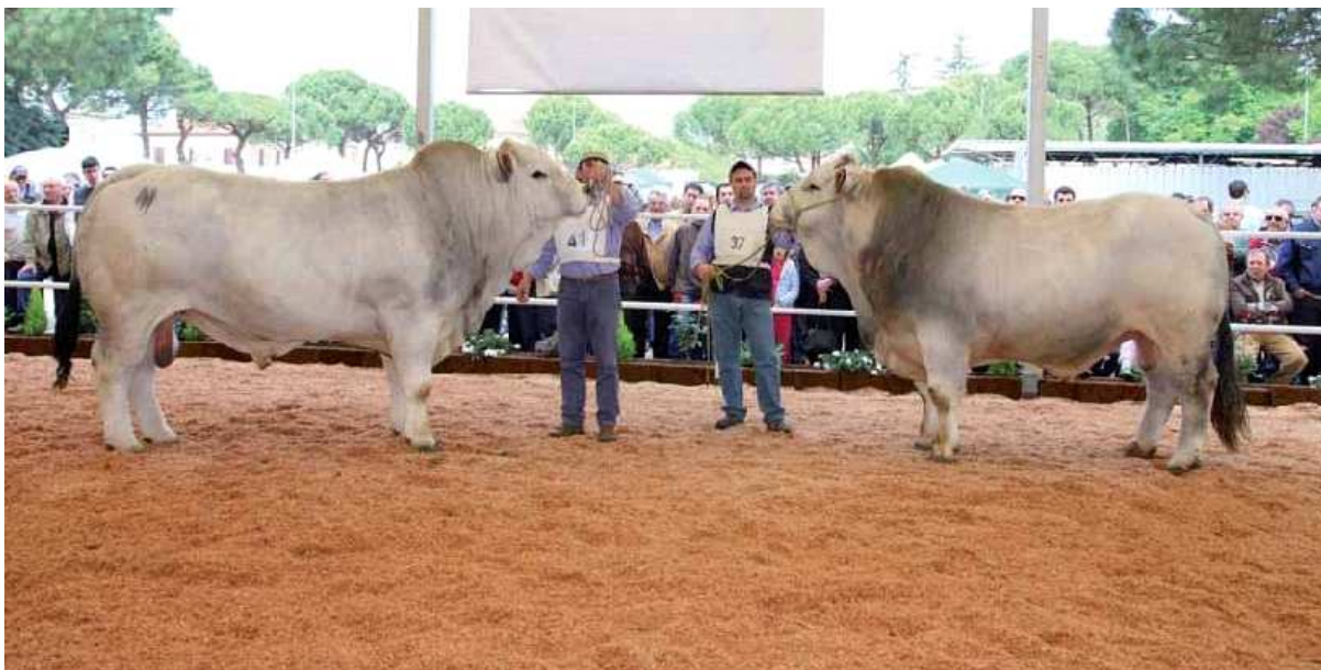
From the left, Quarzo della Radice and Serpico, Senior champion bull and his reserve

setting up of the Herdbook. An integral part of the Ville Unite territory, characterized by estates of important landholding dynasties, San Pietro in Vincoli had become, together with the Estate of the Torlonia Princes of San Mauro Pascoli, one of the breed's strongholds. All the most important bull stud farms and the greatest sires, starting with Medoro, were in its district or neighbouring hamlets, and the Mercato Concorso dei Bovini Romagnoli (Market/Competition of Romagnola Cattle), which was held here each year in the Piazza del Foro Boario during the month of September, and sometimes in