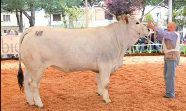
Sulmona, reserve champion senior cow – Owner Mariani S.S. (FC)