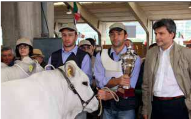
“La Bigotta” farm awarded for the best Breeding Group