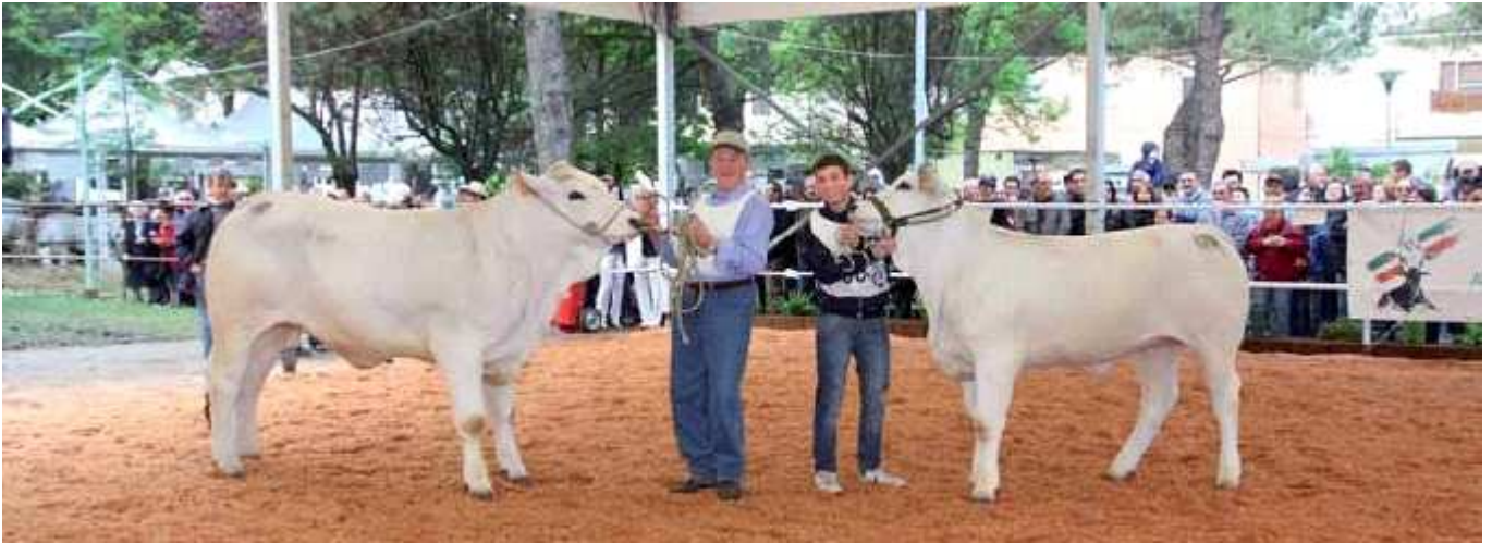
At the left Tosca delle Querce, the junior champion heifer. At the right Unica della Mezza Ca', the reserve junior champion heifer of the show.