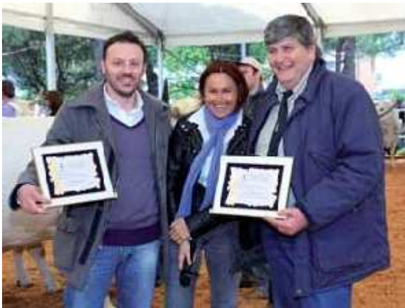
Awards of judge and his assistant