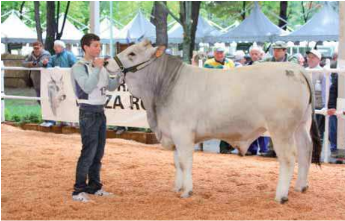
Ulisse della Mezza Cà, Junior champion bull; Owner. Daga F.Ili – (FC)

November, featured hundreds and hundreds of animals.