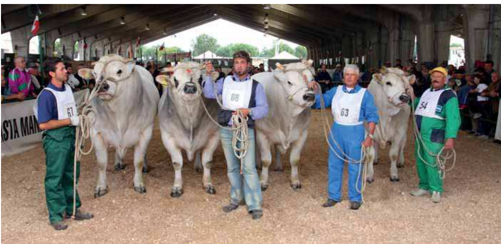
The Farm "Mei di Mei Marco" awarded as the best exhibitor of the show

Also during the show, the Marches Region organized a conference on