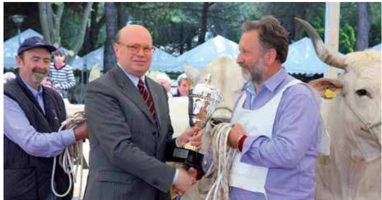
Awards of La Viola Farm like best breeder, best shower and best breeding group of the 2009 National

The final of the heifers was a parade of stars. The judge's decision rewarded Tosca delle Querce followed by Unica della Mezza Cà, of a very similar model, for her singular vigour and the greater