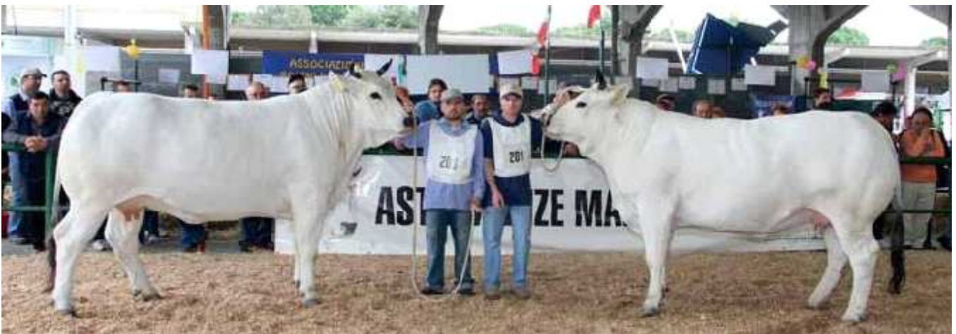
From left: Quercia and Quercia, champion cow and her reserve senior champion cow of National Show