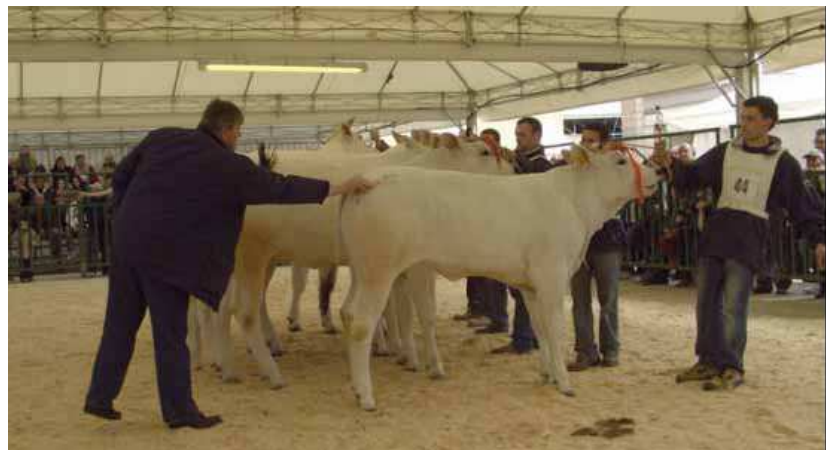
The proclamation of the junior champion heifer