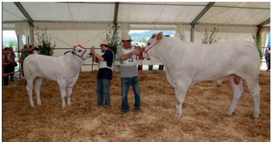
From right, Unas dei colli and Umbro, junior champion bull and his reserve

Unas dei Colli, a son of Quinto presented