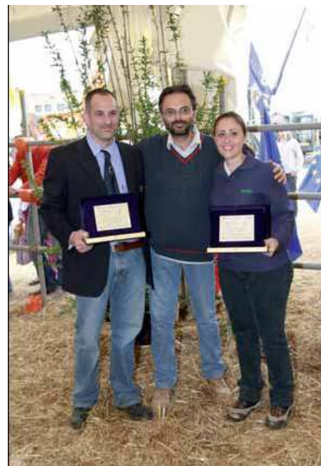
The judge and his assistant

Here ends the comment on the 2009 National Chianina Show, during which the breed confirmed all its value once again. The relaxed atmosphere backstage and the tasty tidbits popping up miraculously from the "magical" trunks of the breeders also contributed to a merry and pleasant environment.