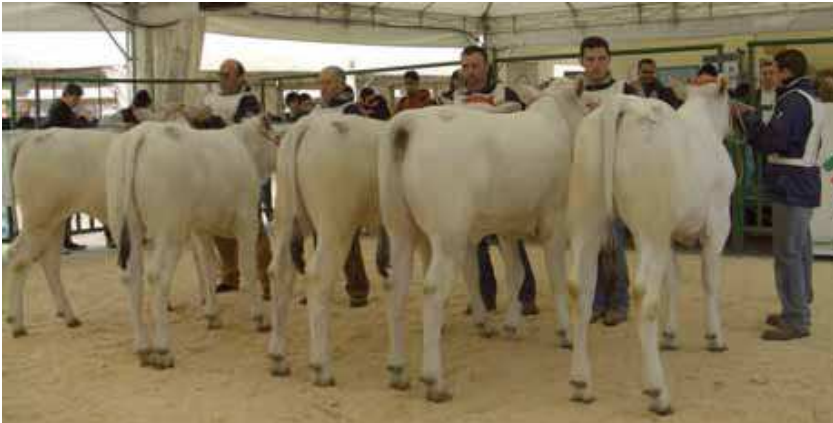
A moment of the judgement

showcase, represented by the interregional show of Central Italy. As for the other beef breeds, worthy of note in this edition was the participation of the ANACLI (National Association of Charolais and Limousine Cattle Breeders) with a large number of animals representing the Charolais and Limousine breeds (around twenty), while the Red Dappled breed, whose presence at Agriumbria has by now become customary, was also present with a group of animals. The prologue to