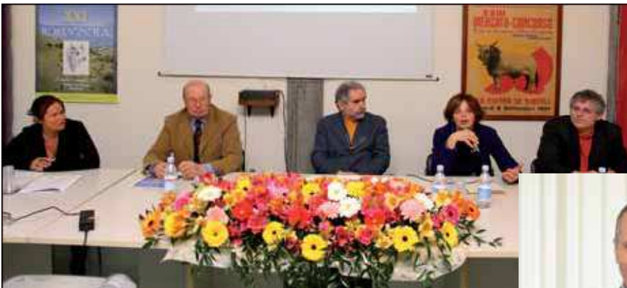
A moment of the meeting

initiative was the photography show set up in the District's conference hall, which included a display of period catalogues and numerous period photos of the competition market, as well as equipment and sashes provided by the owners of local public stud farms. The same hall