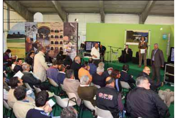
A moment of the meeting

Bullock, who introduced the subject of the